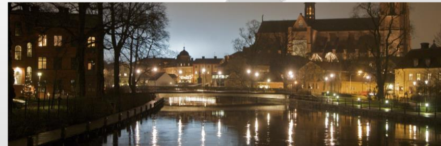
SWEDEN – SUST / Uppsala Kommun