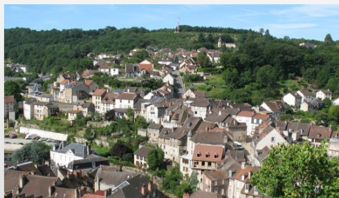
FRANCE – ALEC / Nouvelle Aquitaine