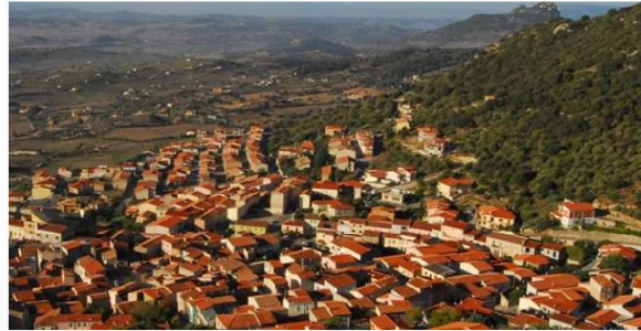
ITALY – GRID / BM