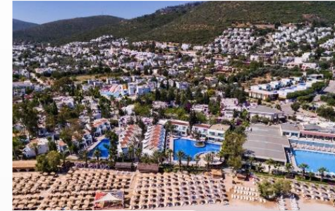
TURKEY – TROYA / UEDAS