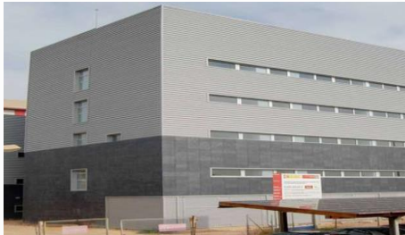
Spain – UMU PoC